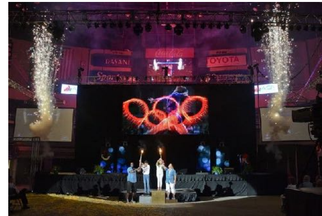
2018 Opening Ceremony, Von Braun Center

Our goal is indeed to surpass all expectations. Together, this will be achieved with careful planning and production.